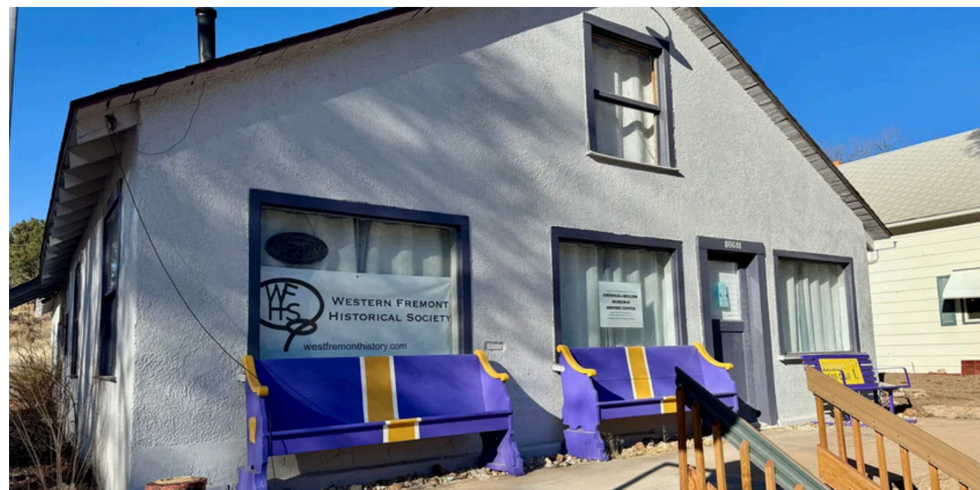
Howard History Center (0070 Co Rd 56, Howard, CO 81233)