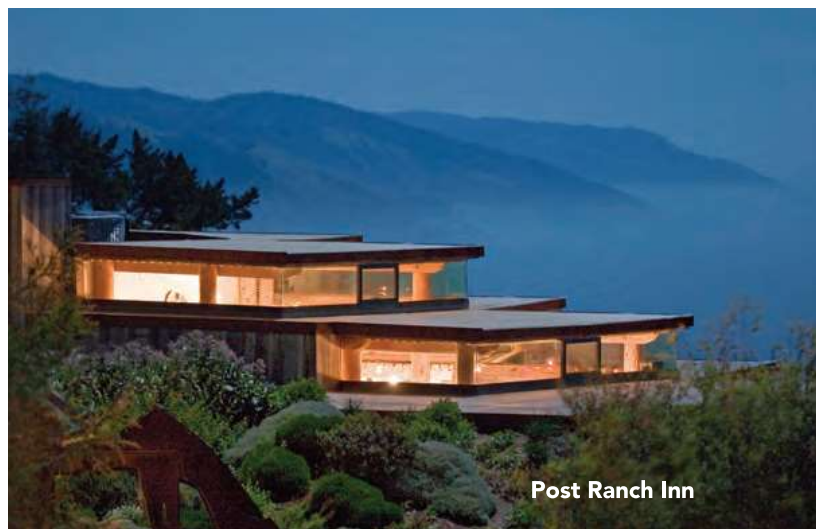
Post Ranch Inn

If you can’t bring yourself to choose between the mountains and the sea, Oil Nut Bay on Virgin Gorda’s North Sound gives you the best of both worlds, showcasing the cobalt water and rugged coastline. Accessible only by boat or helicopter, the exclusive property’s 26 accommodation offerings range from cliffside one-bedroom suites to six-bedroom villas, some as high as 700 feet above sea level. The 400-acre landscape offers five hiking trails for sweeping views of the Caribbean Sea, tennis and pickleball courts and an on-site barn for rescued animals including retired racehorses, an emu and flamingos. Venture into the water for snorkeling, reef diving, sea kayaking and sailing and refuel with an alfresco meal and a cocktail at Nova, the resort’s new overwater restaurant and bar.