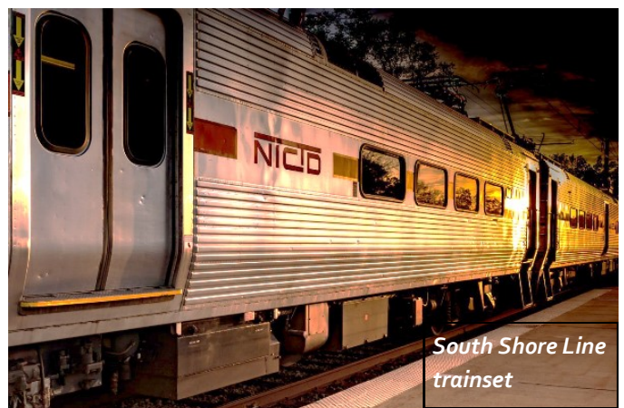
South Shore Line trainset

Previously, trains on the corridor had to deal with multiple dispatchers (five or six) to traverse the relatively short distance from Dyer, Indiana, to Chicago Union Station. This led to serious delays, hence poor on time performance. With the completion of the exciting new West Lake Corridor of the South Shore Line (Northern Indiana Commuter Transportation District - NICTD) providing service to Dyer, it would be possible for the Hoosier State to terminate in Dyer. Passengers would then do a cross platform transfer to a South Shore Line train and continue on into Millennium Station in downtown Chicago. It should be noted that the South Shore Line has a very good on time performance record. This solves the problem of the multiple dispatchers, and leads to a significant improvement in on time performance.