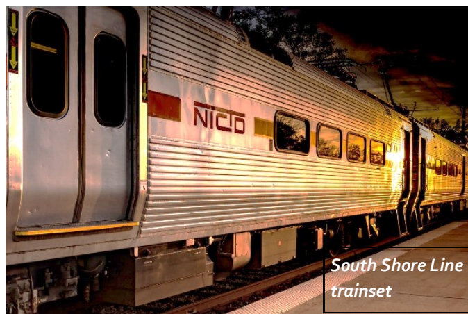
South Shore Line trainset

Previously, trains on the corridor had to deal with multiple dispatchers (five or six) to traverse the relatively short distance from Dyer, Indiana, to Chicago Union Station. This led to serious delays, hence poor on time performance. With the completion of the exciting new West Lake Corridor of the South Shore Line (Northern Indiana Commuter Transportation District - NICTD) providing service to Dyer, it would be possible for the Hoosier State to terminate in Dyer. Passengers would then do a cross platform transfer to a South Shore Line train and continue on into Millennium Station in downtown Chicago. It should be noted that the South Shore Line has a very good on time performance record. This solves the problem of the multiple dispatchers, and leads to a significant improvement in on time performance.