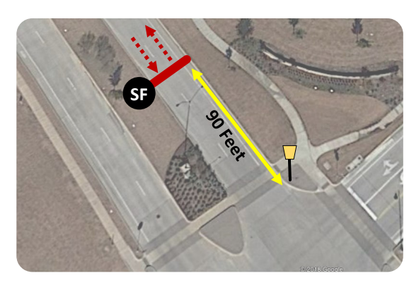
Start Finish = 90 ft. N. of bike lane sign at Amador & Hillwood GPS: N32° 55.042' W97° 18.709'