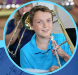
Step-Up & Professional Instrument Sales

12842 W 87th St Lenexa, KS (913) 894-4349