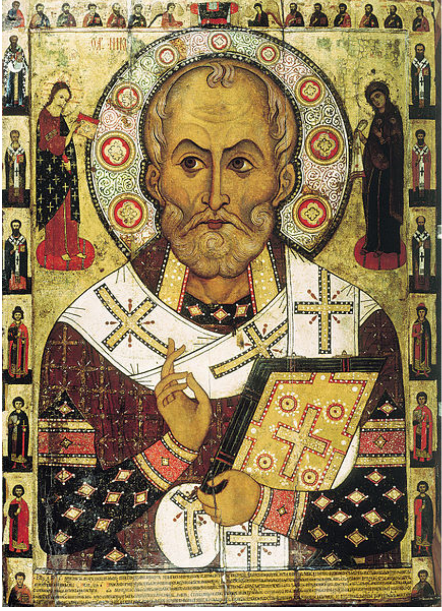
http://en.wikipedia.org/wiki/File:Nikola_from_1294.jpg This is a faithful photographic reproduction of an original two-dimensional work of art. This photographic reproduction is therefore also considered to be in the public domain.