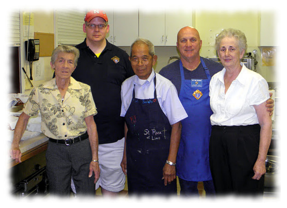
Thank those workers in the Kitchen for their dedicated and hard work in making the Veteran's Day Dinner a great Success!