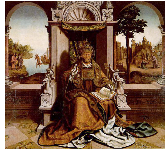
http://commons.wikimedia.org/wiki/File:GraoVasco1.jpg This is a faithful photographic reproduction of an original two-dimensional work of art. The work of art itself is in the public domain for the following reason: * This image (or other media file) is in the public domain because its copyright has expired.

In our next issue we'll look at: Did Paul Challenge Peter's Authority?