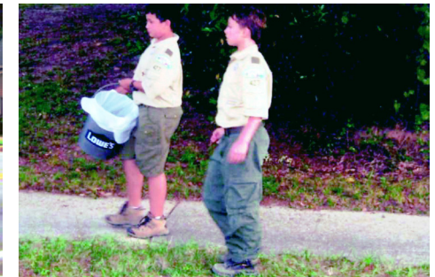
I've got my bucket, my Buddy and that's all I need.