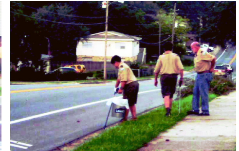
"You missed a piece over here."