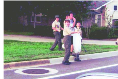
Troop 427 Park Avenue Clean-up