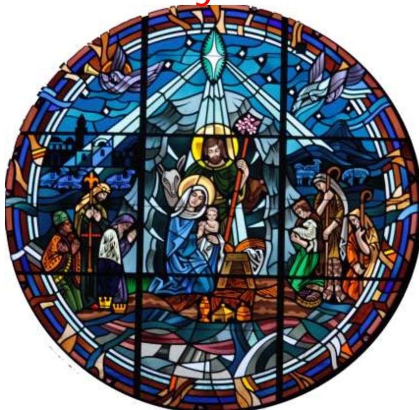
Window on the south wall of St. Rose of Lima.