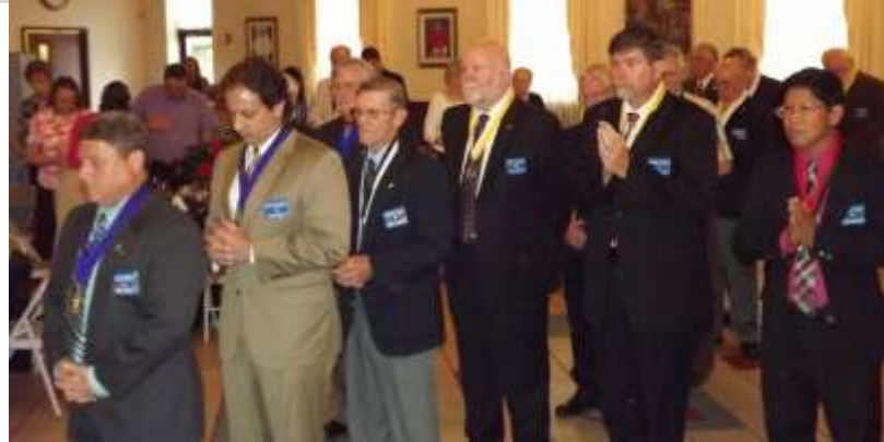
Council Officers in formation during prayer for their success.