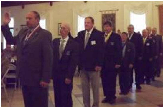
Assembly takes oath of office.