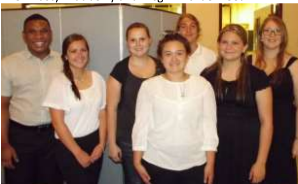
Teen Youth provided food servers for the banquet. Thank you!

The Auxiliary presented the Council with two checks, one for $1000.00 for the "Widows Fund" and one for $600.00 for our "Scholarship Fund." They were most gracious and supportive to provide these funds and the Council expresses a heartfelt "THANK YOU!"