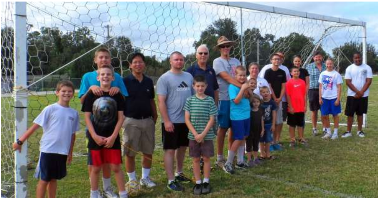
Participants, Parents and Knights of Columbus Council 7027 Volunteers for the 2014 annual Knights of Columbus Soccer Challenge.

Each of these District winners is eligible to compete in the Regional competition to be held on October 18 th at Crestview High School. We wish the best of luck to all competitors in their endeavors toward Regional, State and International levels.