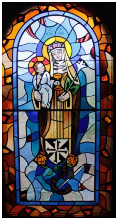
St. Rose of Lima window located left of main altar in St. Rose of Lima Catholic Church, Milton, FL.