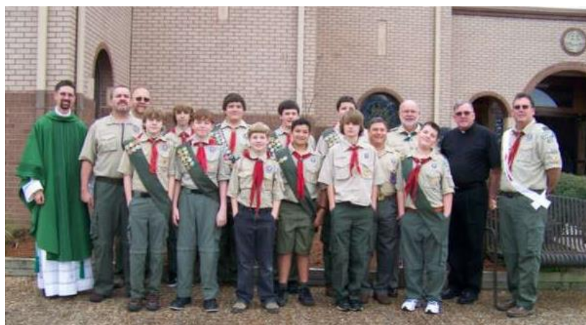
Boy Scout Troop 427

Whether our parish starts a new troop, sponsors an existing one, or encourages young people to join another scouting troop, the results are a brighter future with more and certainly better leaders!