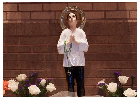
St. Lorenzo Ruiz pray for us. (See Page 6)