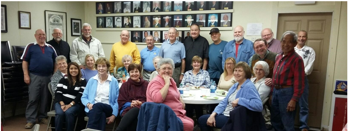
Fourth Friday Night Social at the Knight's Hall, January, 27,2016. A good times was had by all!

The Grand Knight is inviting each of you and your spouse to our monthly Friday evening Social at the Knights of Columbus Building, located on the St. Rose of Lima Festival Grounds. The Social will begin at 5:30 p.m. on February 24th. You are asked to bring a side dish to share with at least 20 people.