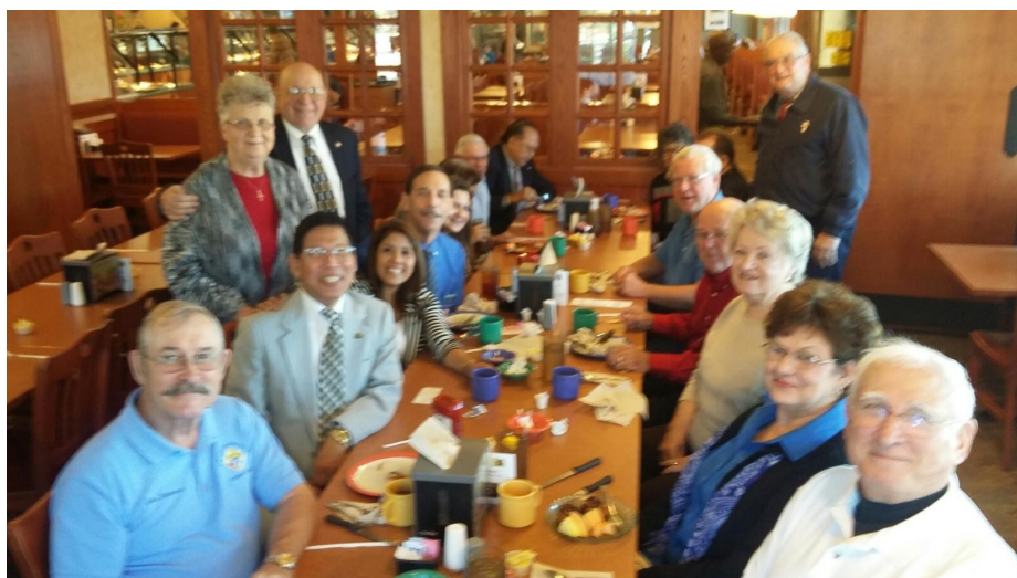
Breakfast at Ryan's Steak House after Corporate Communion on January 29, 2017.

After comparing this programming to mainstream programming, why not leave your radio tuned to 103.3 FM all the time?