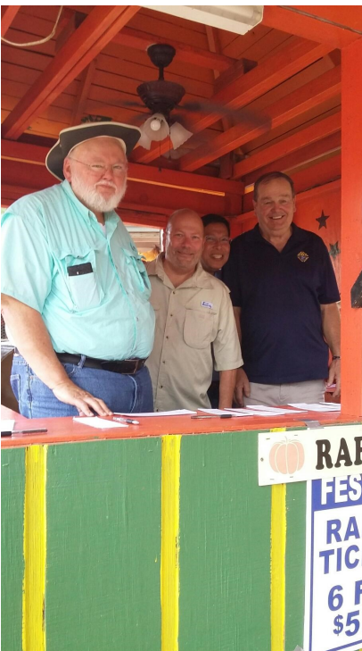
Knights selling raffle tickets.