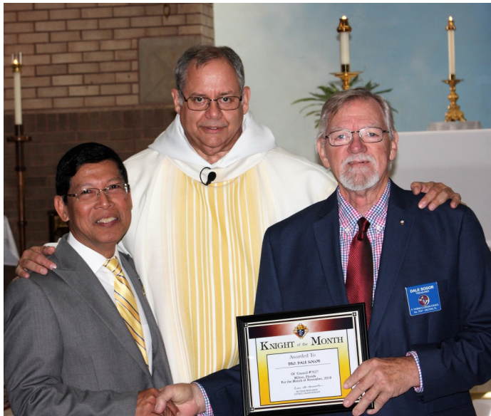
Knights of the Month