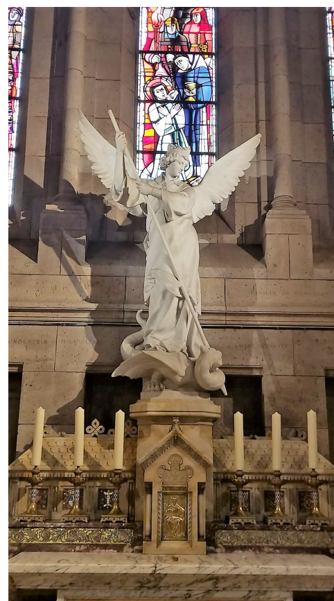
Altar of Saint Michael at Sacre-Couer in Paris