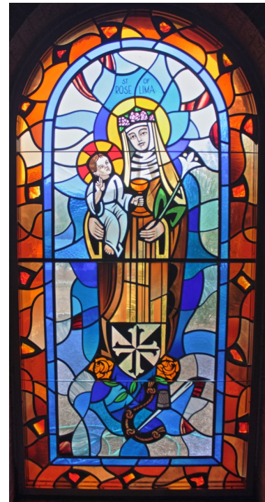
St. Rose of Lima

After reading about St. Catherine of Siena, St. Rose considered her a worthy model. She would fast at least three times a week and would secretly add severe penances. She received the Blessed Sacrament daily and would spend much of her time alone in a grotto in her family's garden.