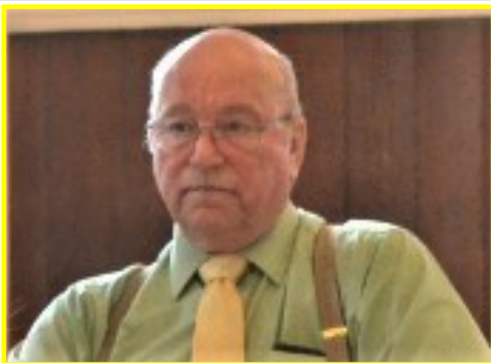
Knights of the Month