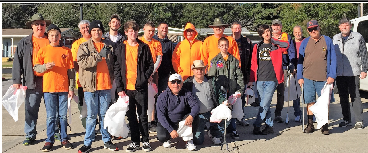
Park Ave Cleanup

Knights of Columbus Council 7027, Boy Scout Troop 427, and other parishioners of St. Rose of Lima Catholic Church participated in Park Avenue Cleanup on Saturday, January 25, 2020. The group met at the St. Rose of Lima Parish Hall just before 9 am for orange juice and donuts, and then picked up trash while leisurely walking along Park Avenue (in front of St. Rose of Lima Church) from Dogwood Drive to Stewart Street. They were done shortly after 10 am. The next Park Avenue Cleanup is scheduled for Saturday, April 25.