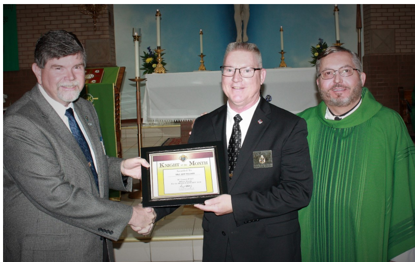
Knights of the Month