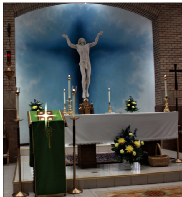
The Enthroned Written Word of God (Sunday, January 26, 2020)