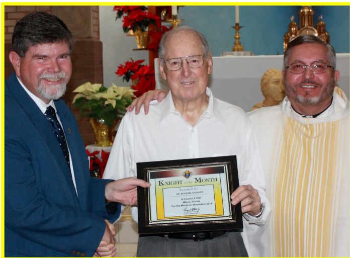
Knight of the Month