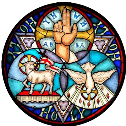
Feast of the Holy Trinity June, 7