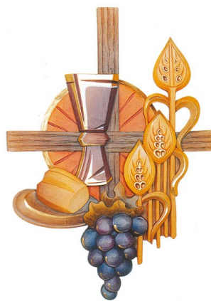
Solemnity of Corpus Christi June, 14