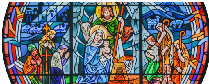
Nativity of Our Lord