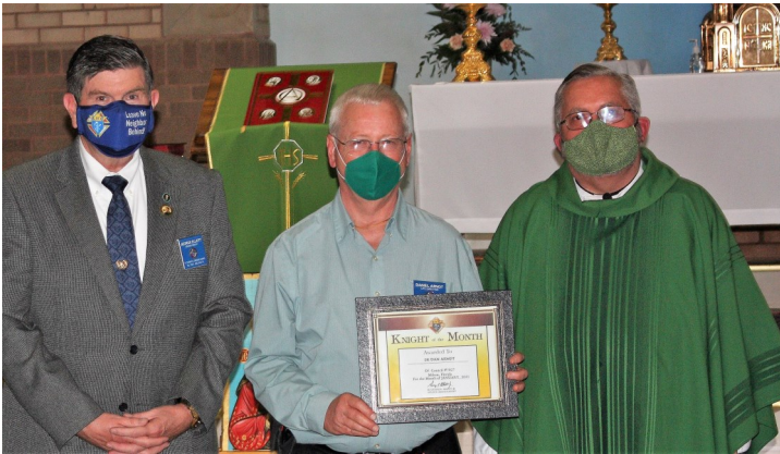
Knight of the Month