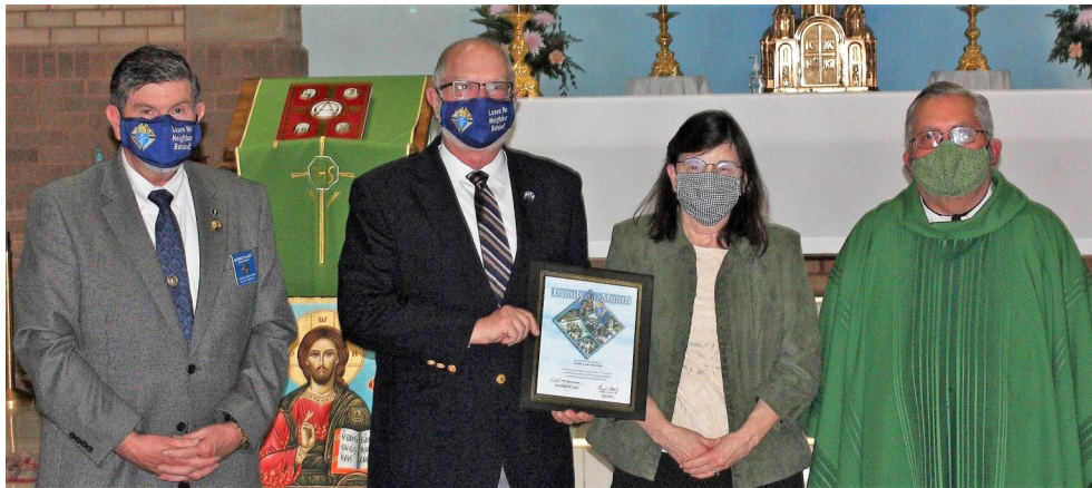
Family of the Month