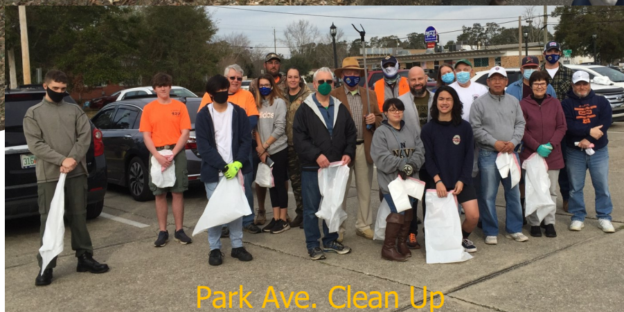
Park Ave. Clean Up