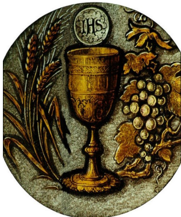
THE MOST PRECIOUS BLOOD