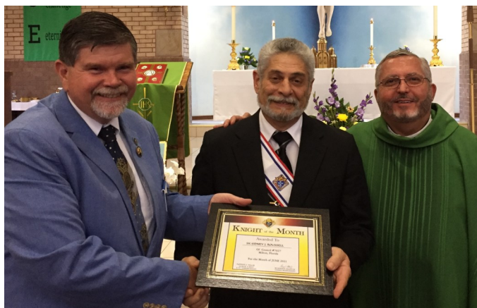
Knight of the Month