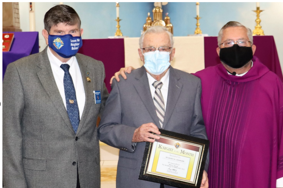
Knight of the Month