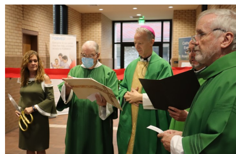
Building Dedication P. 14