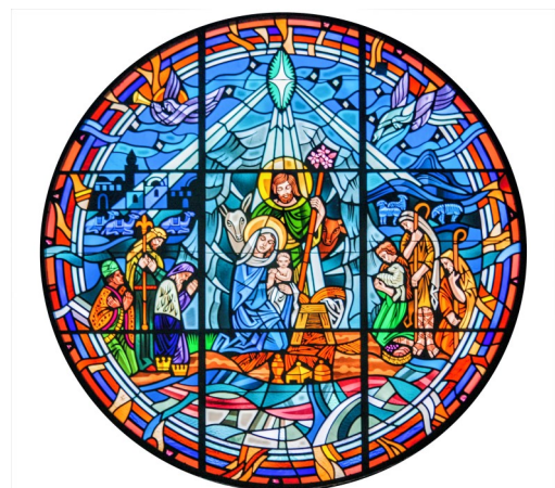
The Nativity of Our Lord December 25