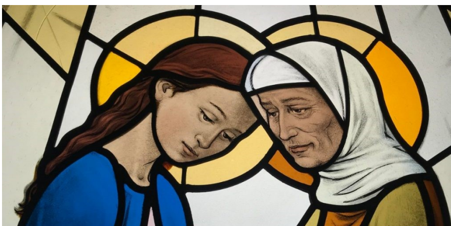
July 15 Visitation of Blessed Virgin Mary to Elizabeth