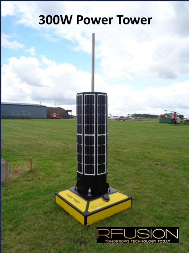
300W Power Tower