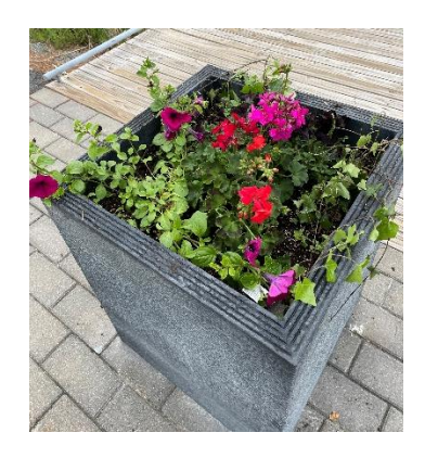
Special thanks to all who make our work possible!