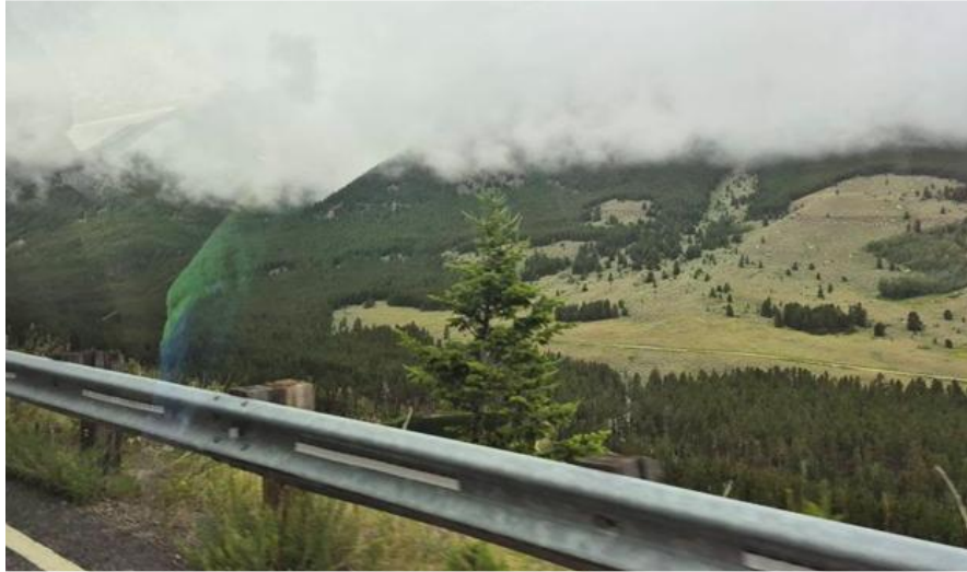
Ride to Beartooth Pass