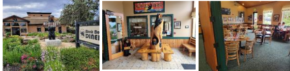
Black Bear Diner, Oakley -