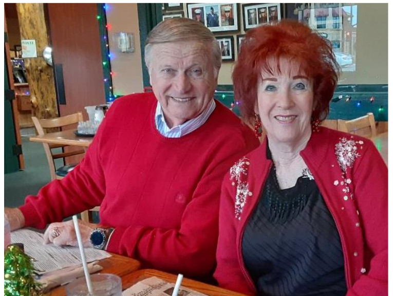
Black Bear Diner, Oakley