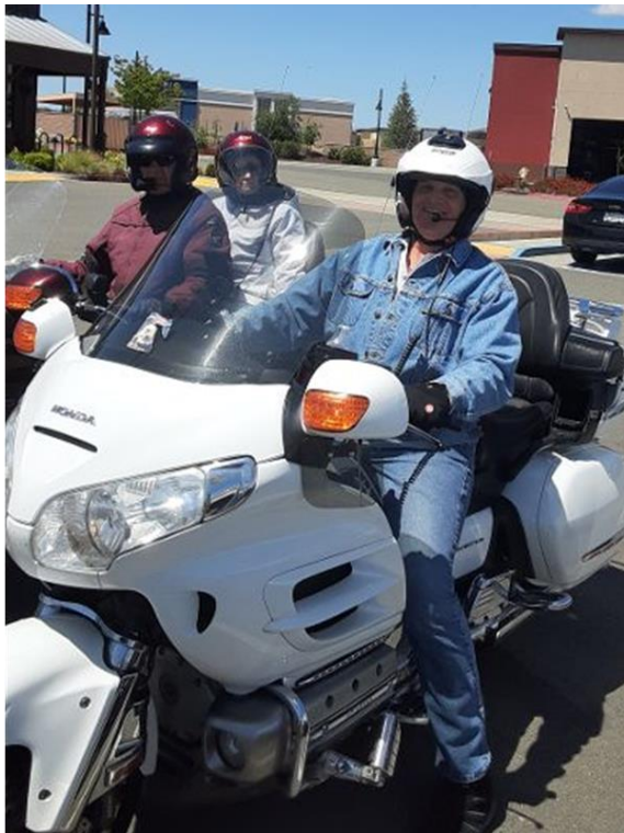
Great motorcycle ride!!!