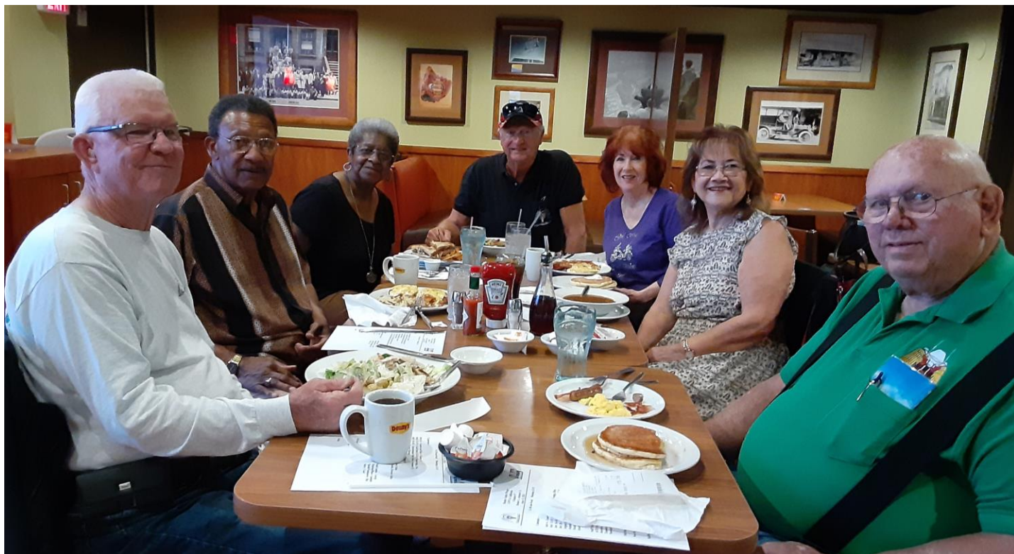
June 15, 2021 lunch group