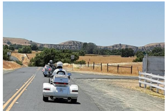
Dan is on the road