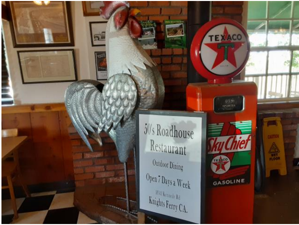
JUNE 1 Ride to Knights Ferry