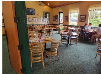
Views of Black Bear Diner, Oakley CA