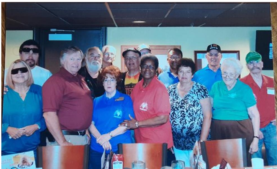
2015 Chapter P members