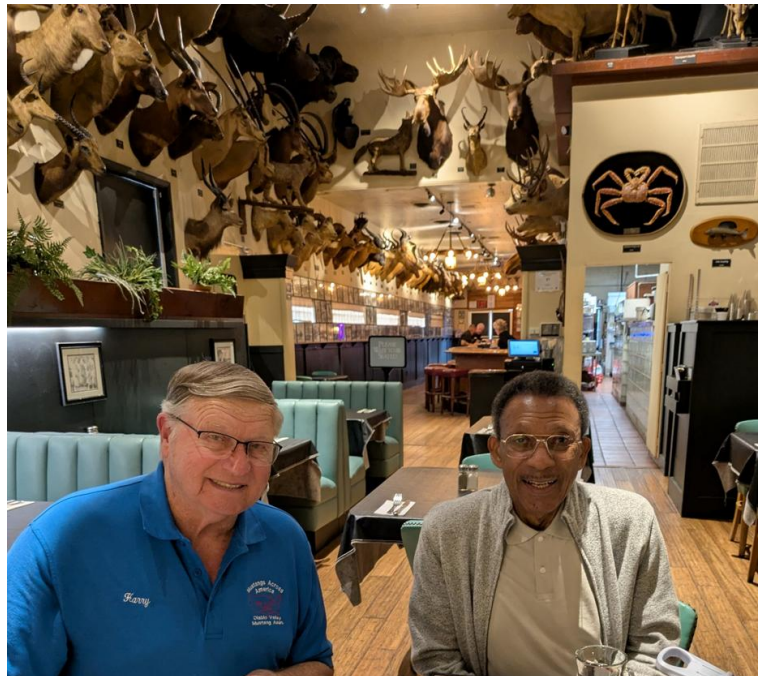
Chapter P members at Foster's Big Horn Restaurant in Rio Vista on April 1, 2025