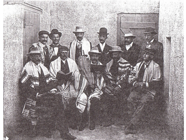
Minyan of Jewish men on Yom Kippur in South Africa (1900). Photo credit: Minyan, De Aar Yom Kippur 1900. De Arr, South Africa

Jeremiah 31:35-37 says that the Jewish people will not cease being a nation before God unless the sun, moon, and stars cease - in other words, ever! While the Hittites, Amorites, Perizzites, and many other nations of the Bible have long since assimilated into the milieu of modern nations, the Jewish people remain, speaking the same language, following many of the same customs, and worshipping the same God as in the biblical record.