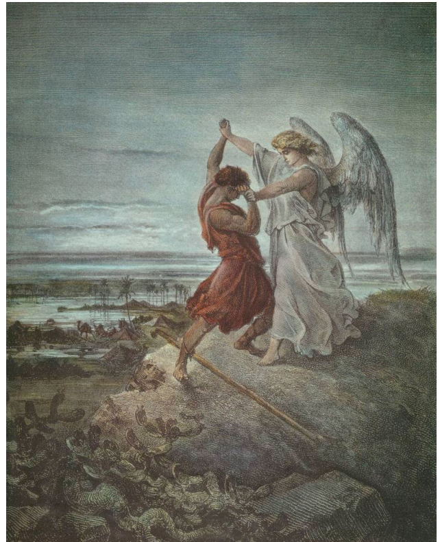
Jacob wrestling with an angel.

By entering into a covenant with God, Abram, Sarai, and their descendants are set apart. Abram becomes Abraham, "father of many." Sarai becomes Sarah, "princess." The two have a son in their old age, Isaac. By doing God's will, Abraham and his family are promised many blessings: they will become a great and fruitful nation, and God will give them the Land of Canaan, a land to be their own forever. Ishmael, Abraham's son by Sarah's maidservant, and his descendants will be blessed, but they are not to inherit Canaan or receive the special status that God gives to Isaac's line. Instead, the covenant is to be passed down from Isaac to his son Jacob.