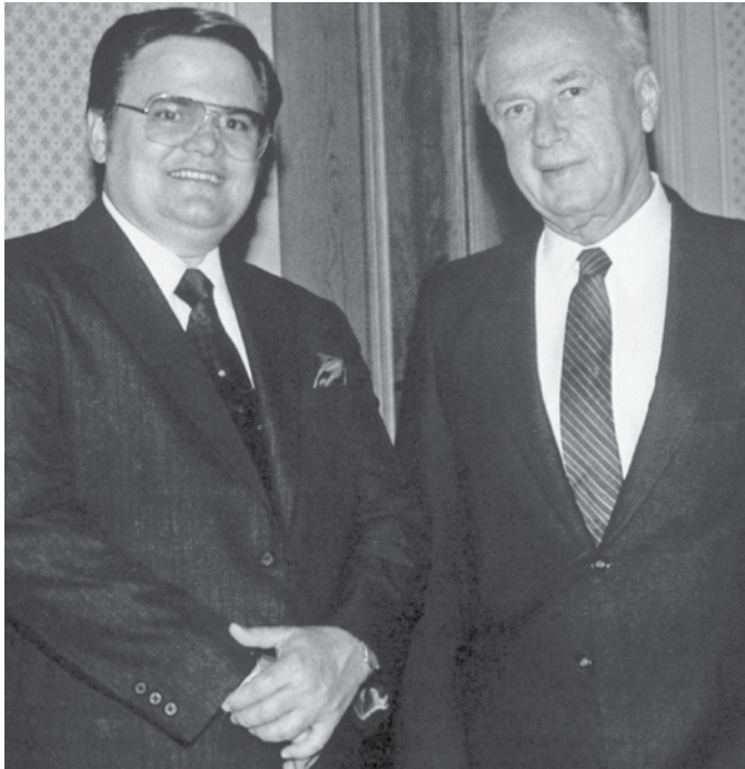
▲ Pastor John Hagee and Israeli Prime Minister Yitzhak Rabin