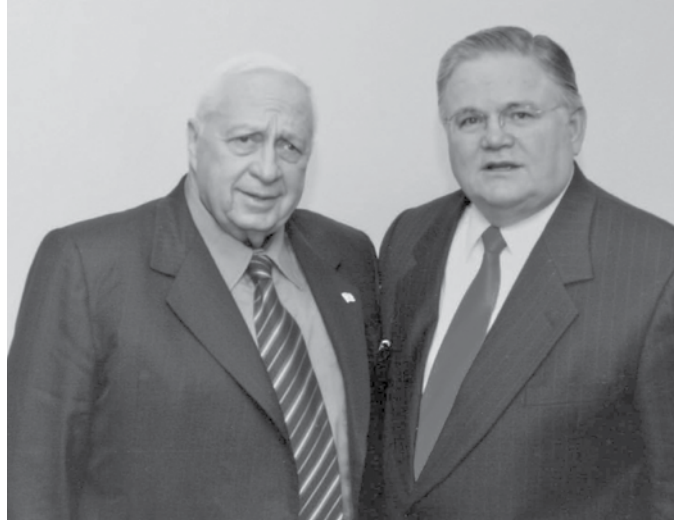
Pastor John Hagee and Israeli Prime Minister Ariel Sharon ▼