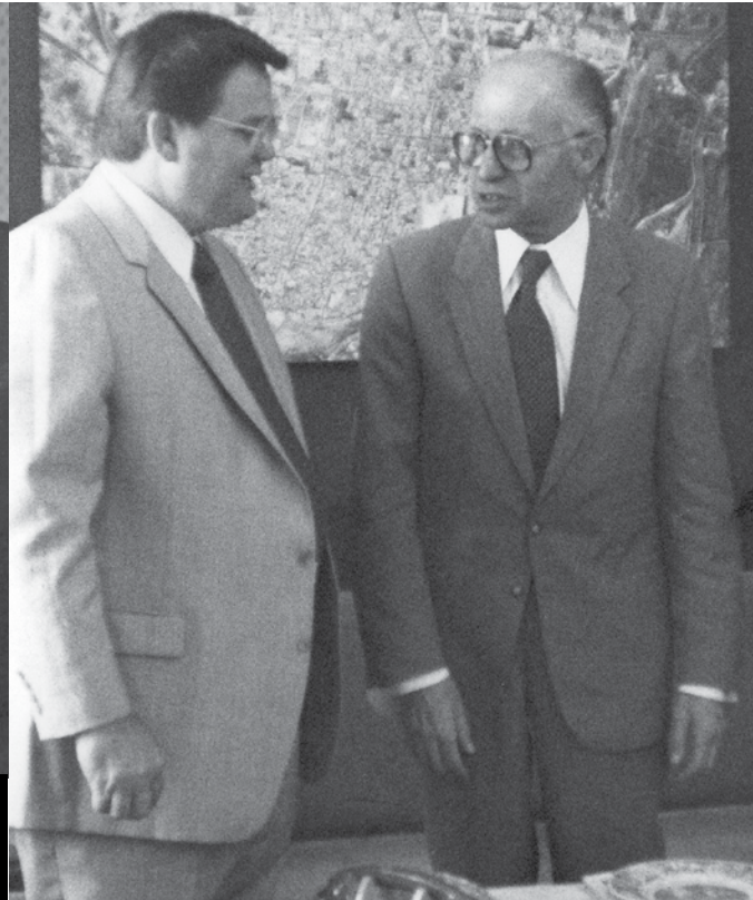
Pastor John Hagee and Israeli Prime Minister Menachem Begin ►