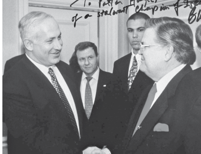
▲ Pastor John Hagee and Israeli Prime Minister Benjamin Netanyahu

As I stated in my book, In Defense of Israel , the Jewish people have suffered persecution and pogroms; they have outlived Pharaoh's slavery, Haman's gallows and Hitler's final solution. And I have no doubt that long after Hamas, Hezbollah and ISIS have been added to the boneyard of human history, and long after the crisis with Iran has been resolved, the flag of Israel will still fly over the ancient walls of the sacred city of David. Jerusalem will continue to be the praise of all the earth and the Jewish people will remain the "apple of His eye" for Israel lives!