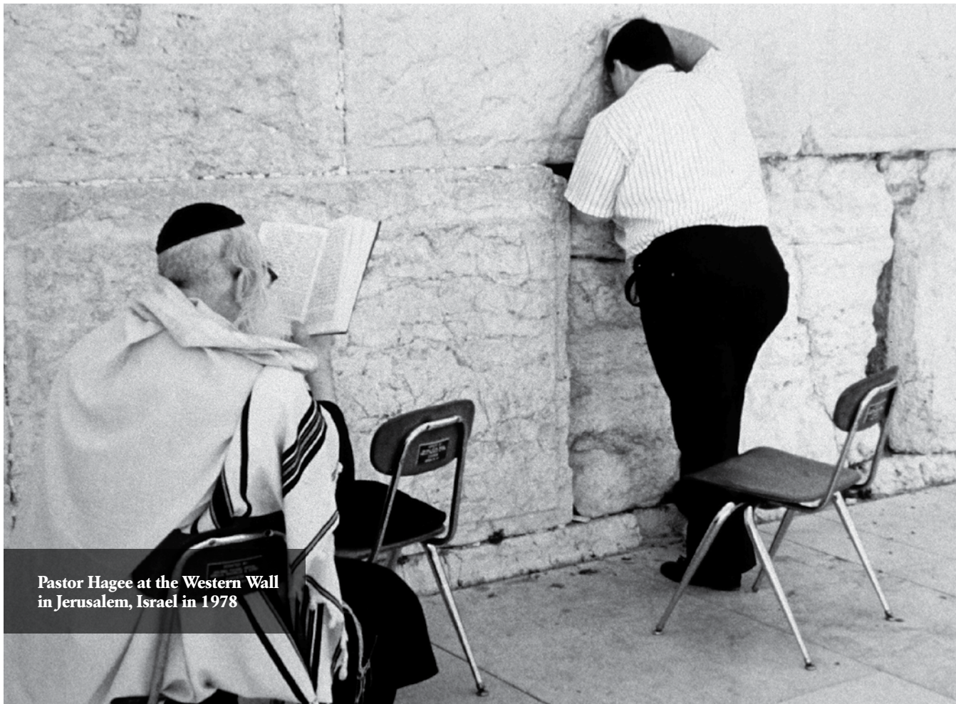
Pastor Hagee at the Western Wall in Jerusalem, Israel in 1978