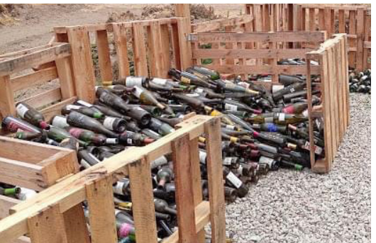
Wine and liquor bottles. Please rinse and place in designated area by color and type.

Location : Off the free road heading east to Valle de Guadalupe, after Magañas, and just over the bridge turn left before the aggregate yard. Follow the signs.