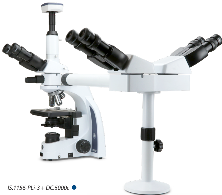
IS.1156-PLi-3 + DC.5000c ●