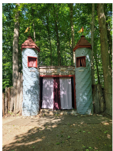
Moon Castle Stage