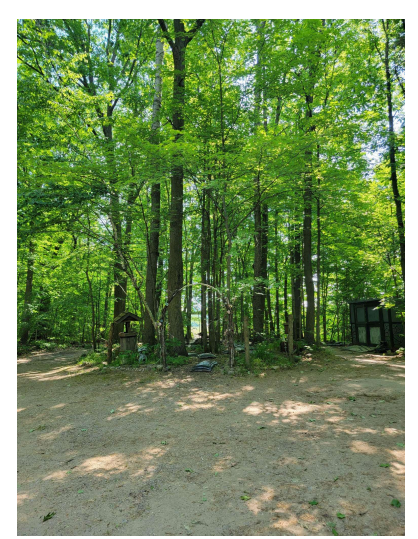
The Fairy Garden