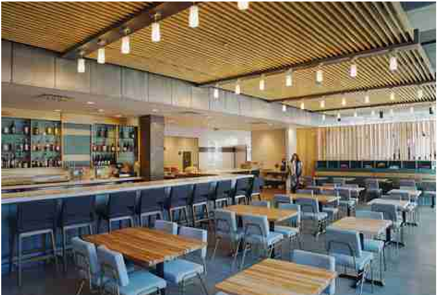
BIRCH + BUTCHER