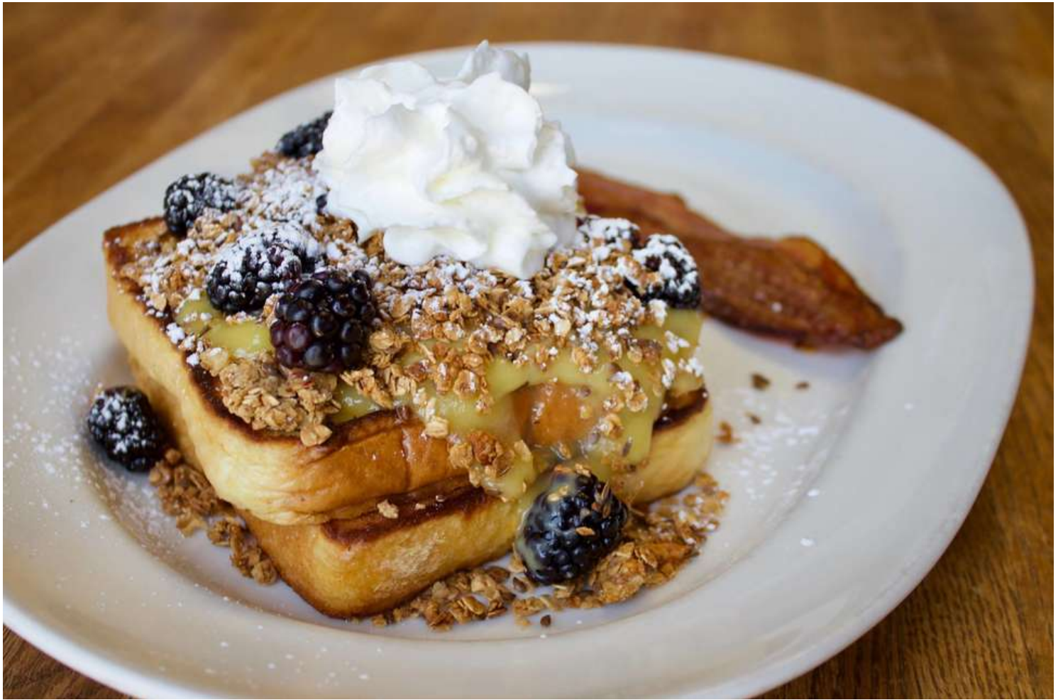
HANKR APP / BLUE'S EGG