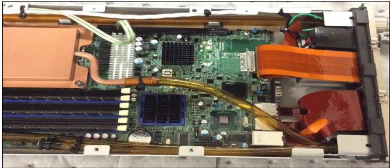
Liquid Cooled server after 36 months of operation