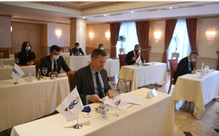
SAA helps Kosovo to strengthen democracy and stability