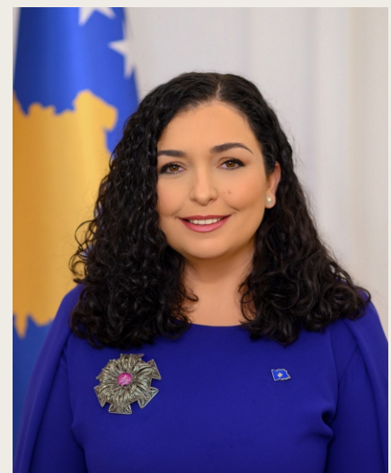
President of the Republic of Kosovo, Vjosa Osmani

K o s o v o ' s parliament has appointed a 38-year-old U.S.-educated female law professor and candidate of the ruling "Vetevendosje" party as the country's new president, following an election in February. Vjosa Osmani took over as acting president of