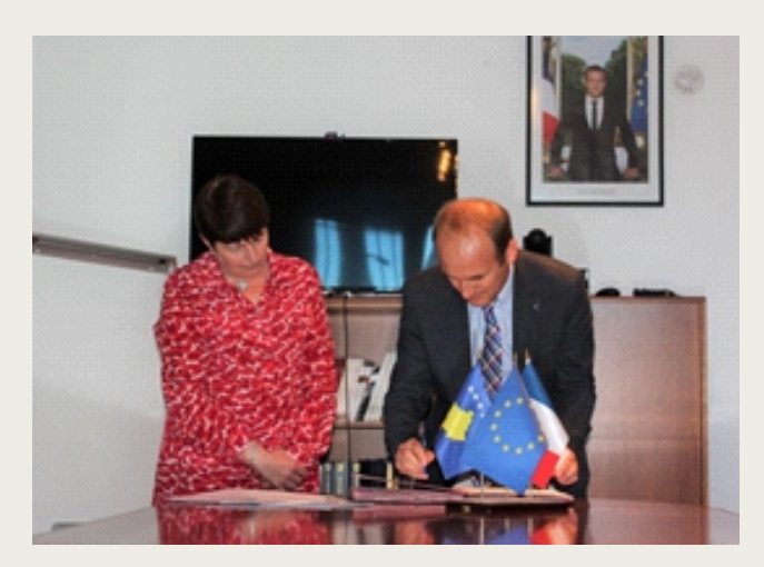
EIC and French Embassy sign a Memorandum of Understanding