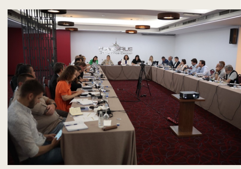
EIC participates in the last consultative meeting for the Energy Strategy 2022 – 2031

Among other things, the Energy Strategy 2022-2031 is the first energy strategy which does not envisage new lignite, envisages carbon tax and envisages ambitious targets for renewable energy, especially solar and wind.