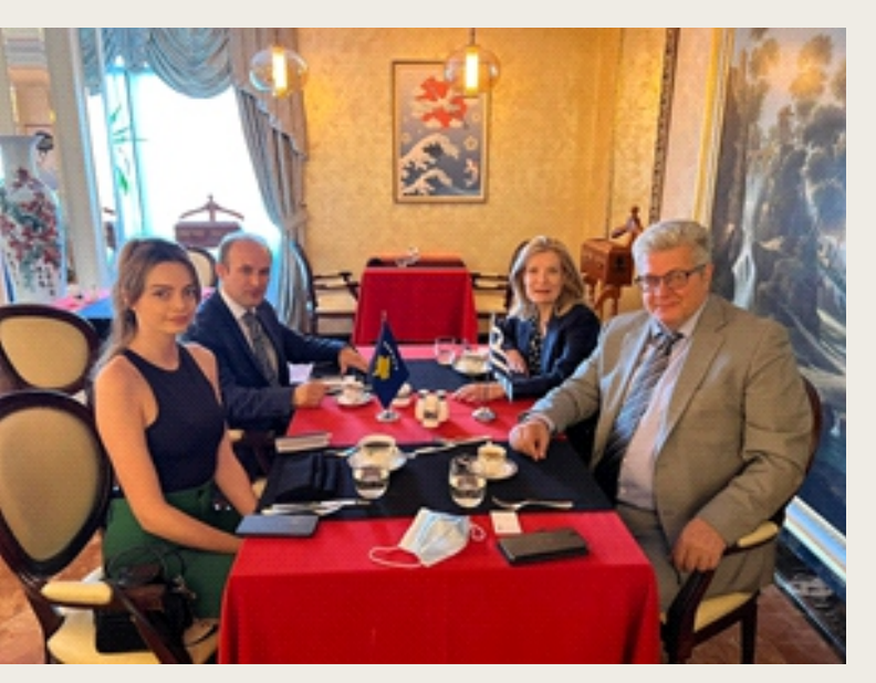
EIC meets Greek Liaison Office to discuss cooperation opportunities between the two countries