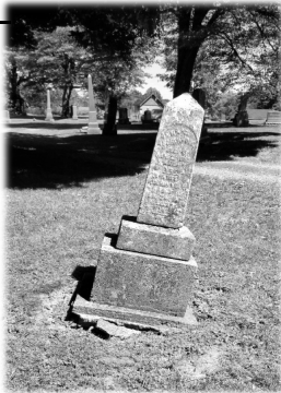
LOT #167 BEFORE

2020 saw a new team of volunteers initiate a Monument Foundation Repair Plan, where tilted monuments were identified, prioritized (safety and imminent toppling). Our team was busy on-site from July through October righting and stabilizing several monuments, twenty-three in total. We are proud to say their cumulative efforts are now quite noticeable upon visiting the cemetery. The list is still long and the schedule for 2021 already impressive. We certainly hope that all will be addressed by the end of 2022. The work on the monuments to date has been done solely by steadfast volunteers and members of our board of directors. A special thanks to Glenn Cowan!