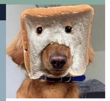
I'm hiding because I'm ashamed that my human left my mess behind.

The Board of Directors is thankful and appreciates the efforts and faithfulness of all those who are picking up after their dogs and putting the waste in the containers. A big "THANK YOU" to all of you! But there has been an uptick in these sightings. If you are a dog owner, please pick up after your dog. It is a Deerfield Beach law and a rule of the HOA. Their waste is not fertilizer. It is toxic to humans and the environment, and eventually leeches into the ground and lake water. Other dogs sniffing or eating it (yuck) can pick up worms or diseases not to mention that it can also contaminate children. Please be responsible and obey the law.