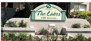
The Lakes HOA Private Page

Follow these instructions to request access to The Lakes HOA Private Page for homeowners only.