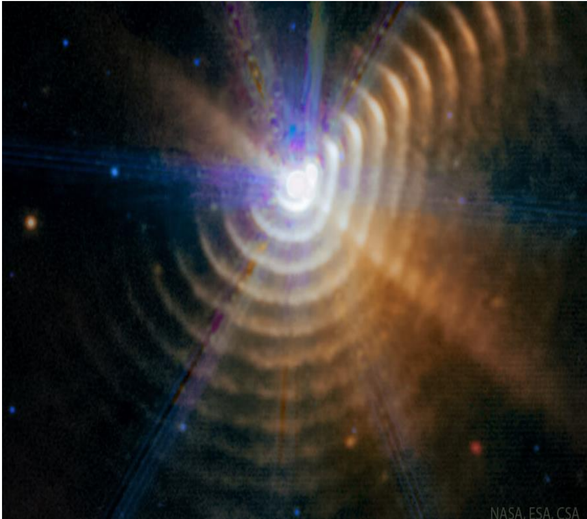
Dust Shells around WR 140 from Webb

On January 29, 2025, NASA posted its Astronomy picture of the day, as seen below. Remember, on that day, the Army Black Hawk helicopter smashed into the American Eagle airliner over the Potomac River between the U.S. Capitol Building and the Pentagon.