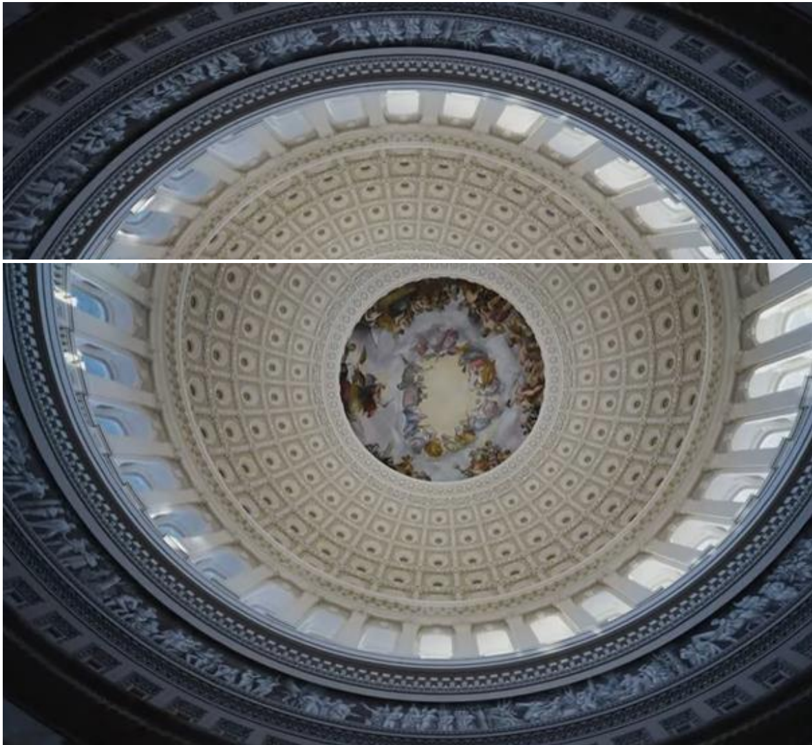
The Presidential Inauguration in the Rotunda of the U.S. Capitol in Washington, Monday, January 20, 2025.

Remember back in October 2024, January 20, 2025, was scheduled to be the inaugural day for the prophetic transfer of allegiance to Judahtocracy per Isaiah 19:21. Of course, on January 20, 2025, Trump was inaugurated as the prophetic President of America, yet true to form, both Trump and Harris were in the moment of prophetic ecstasy, standing under the Rotunda—Judah’s dome, a symbolic representation of the divine authority of Judah, as the Hosts of Heaven stood